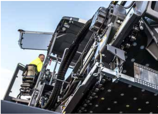
HEIGHT ADJUSTABLE PLATFORM FOR EXCELLENT OVERVIEW