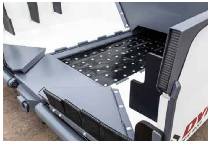
LARGE CONVEYOR TUNNEL FOR BULK MATERIAL TRANSFER

Dynapac feeders are best known for their powerful and durable conveying systems. The 1200 mm wide conveyor with